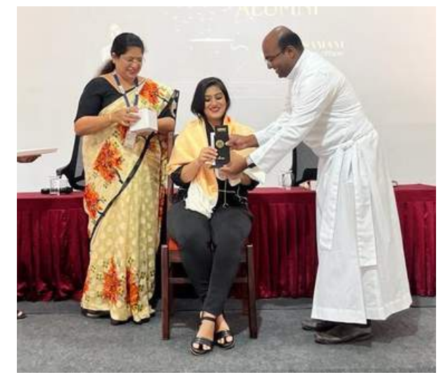
Felicitation of the Alumni