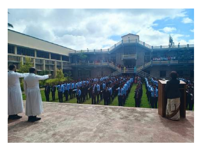
Administering of the Preamble