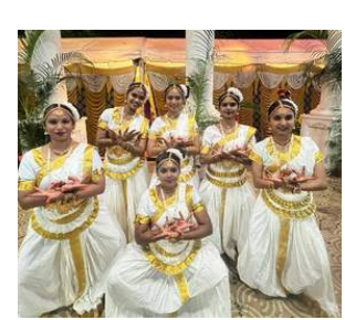
Snippets of Yuva Sambhrama

As a token of gratitude, the Christ College Management gave a High-Tea to the participants and the faculty members in charge.