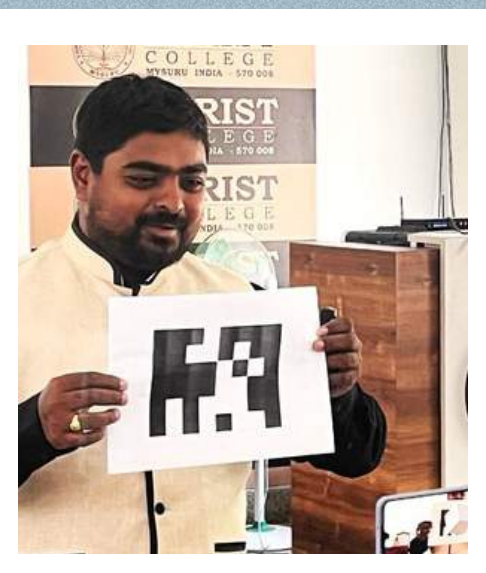
Guest interacting with the students.

He highlighted how languages have evolved to meet the changing needs of developers