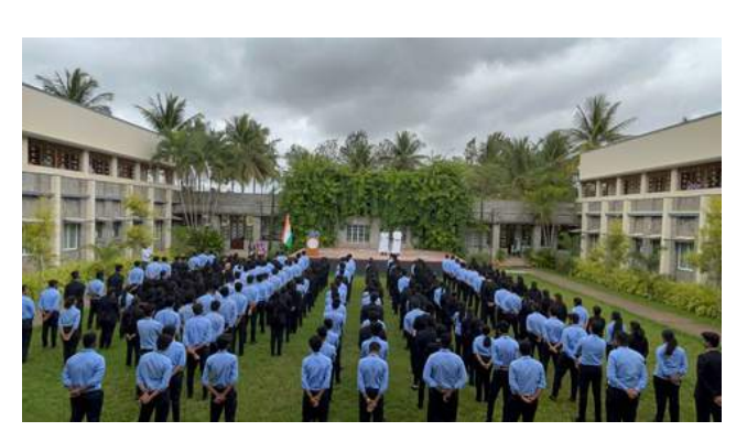
International Day of Democracy

The International Day of Democracy is celebrated around the world on 15th September each year, and this day is celebrated at Christ College, Mysuru to enrich the student's knowledge of Democracy.