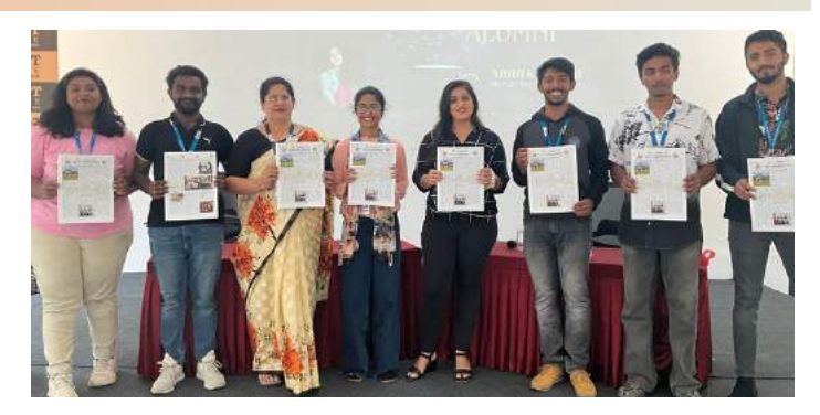
Releasing of Yen Samachara newsletter

She expressed her gratitude for the opportunities and connections she built during her time at Christ. She also offered advice to the current students about the importance of seizing opportunities, building strong connections, and maintaining a strong mindset.